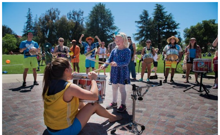
A young fan RTFOs at Meyer Green on Stanford Picnic Day.

Membership: If you are interested in joining the SBAB, please contact me. We now welcome Old Fartz who are not regularly in the Bay Area! Members have been dialing in from afar for a few months already, with our simple and clear teleconferencing setup.