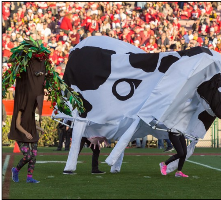
Corn maze thataway.

new relationship with a band that would understand our roots on the Farm was badly misinterpreted as a mocking attack on the state of Iowa. We suspect had the score not been 35-0 Stanford at that point, or had the script been audible on the TV broadcast, or had one of many other things happened, things may have been different. But hey—in the aftermath of it all, we learned a couple of